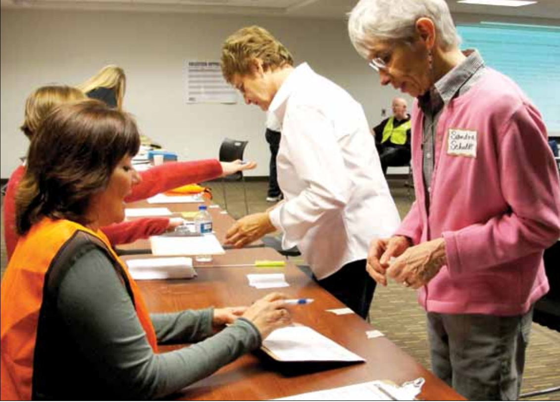
Left: Community members gain valuable disaster preparation experience during the Emergency Volunteer Center training, October 2010.