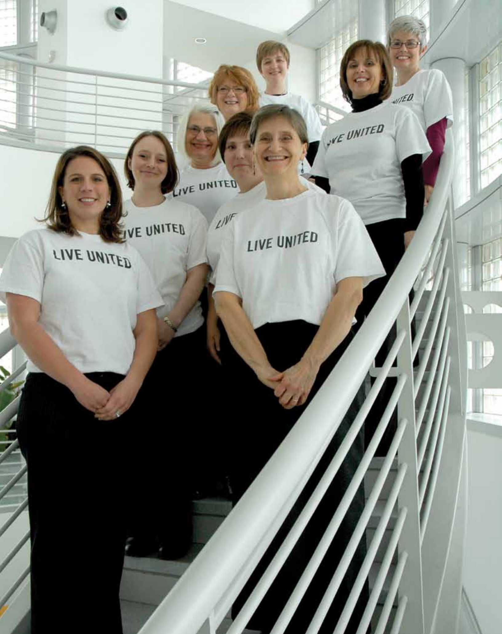
UNIVERSITY OF IOWA FOUNDATION, 2010 SPIRIT OF PHILANTHROPY AWARD