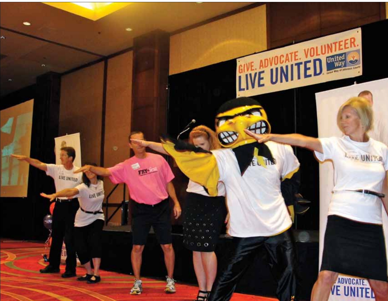
Below: Herky and friends lead the UWJC Community Campaign Kickoff crowd in a warm-up Hokey Pokey. The world record was shattered the next day at FRY Fest 2010.